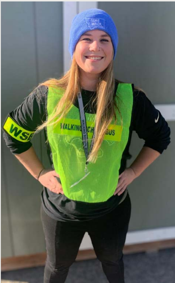
BWMT HIRES NEW